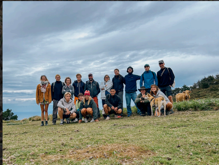
Sylvester Week 2025