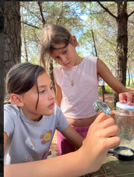
Wild Summer Camp 2025