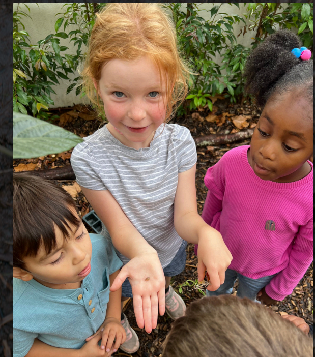
Eco Club 2025