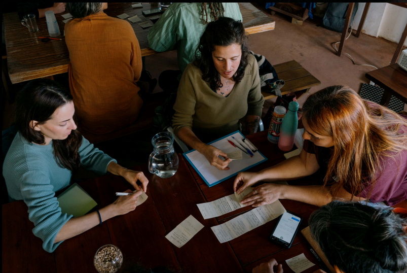
Faixas Vivas 2025