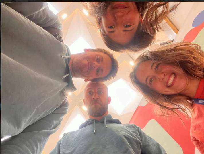
Sinn Congress 2025