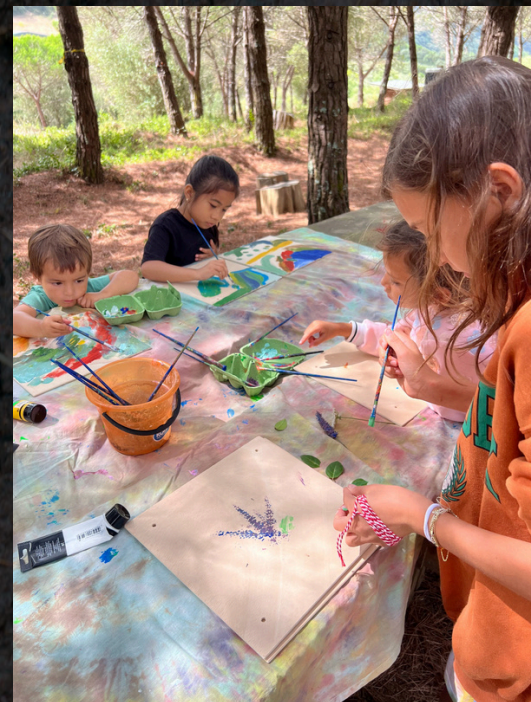
Wild Summer Camp 2025