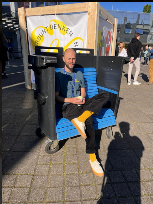
Sinn Congress 2025