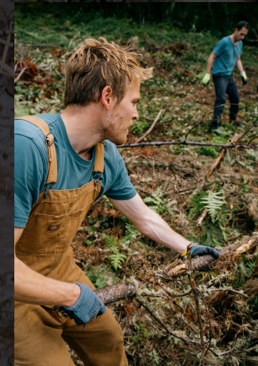
Sylvester Week 2025