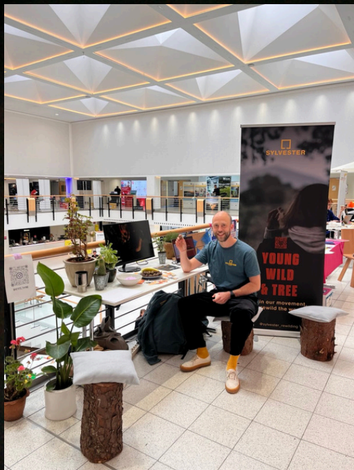
Sinn Congress 2025