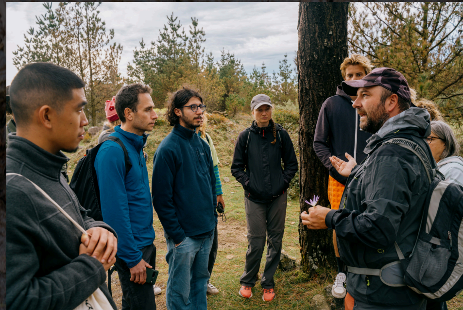
Sylvester Week 2025