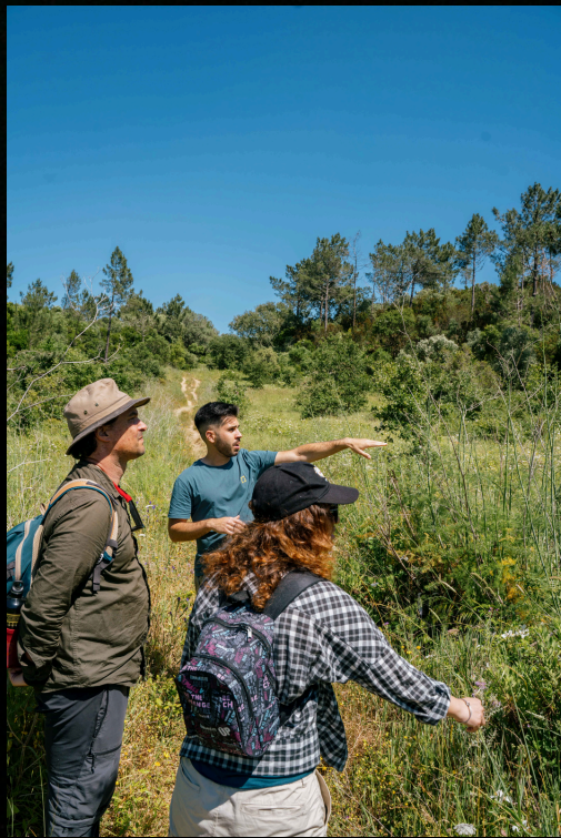
Rewilding with herbivores Workshop