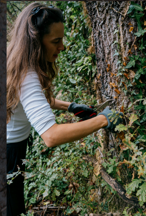
Sylvester Week 2025