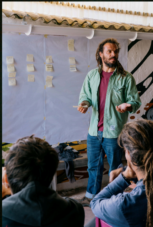
Faixas Vivas 2025