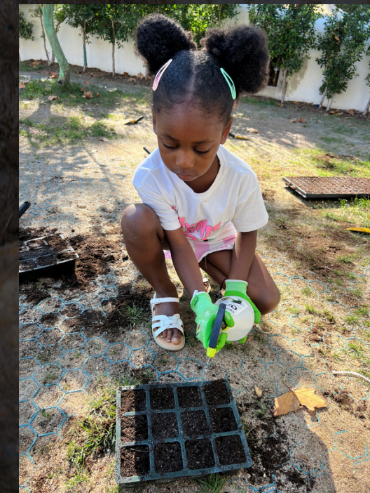
Eco Club 2025