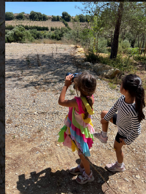
Wild Summer Camp 2025